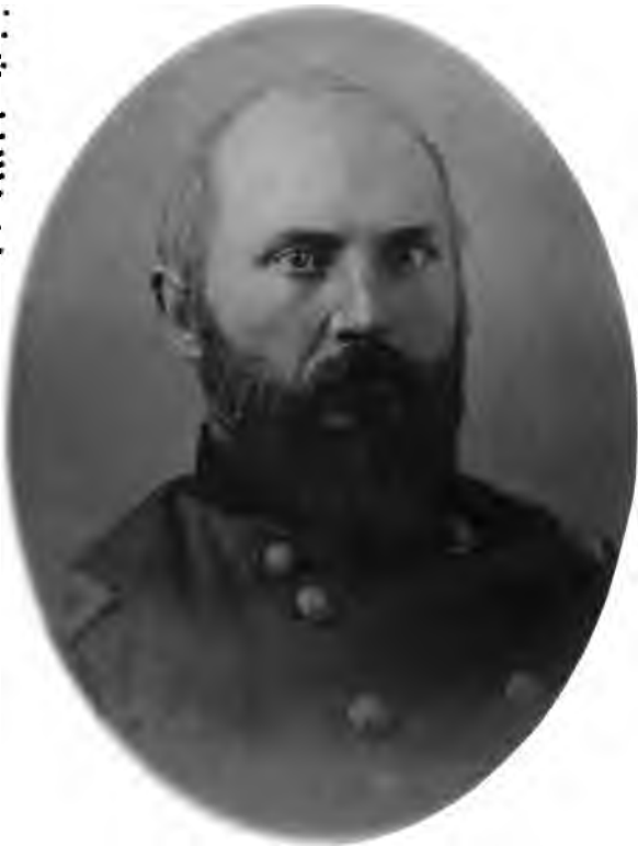
THOMAS T. CRITTENDEN.